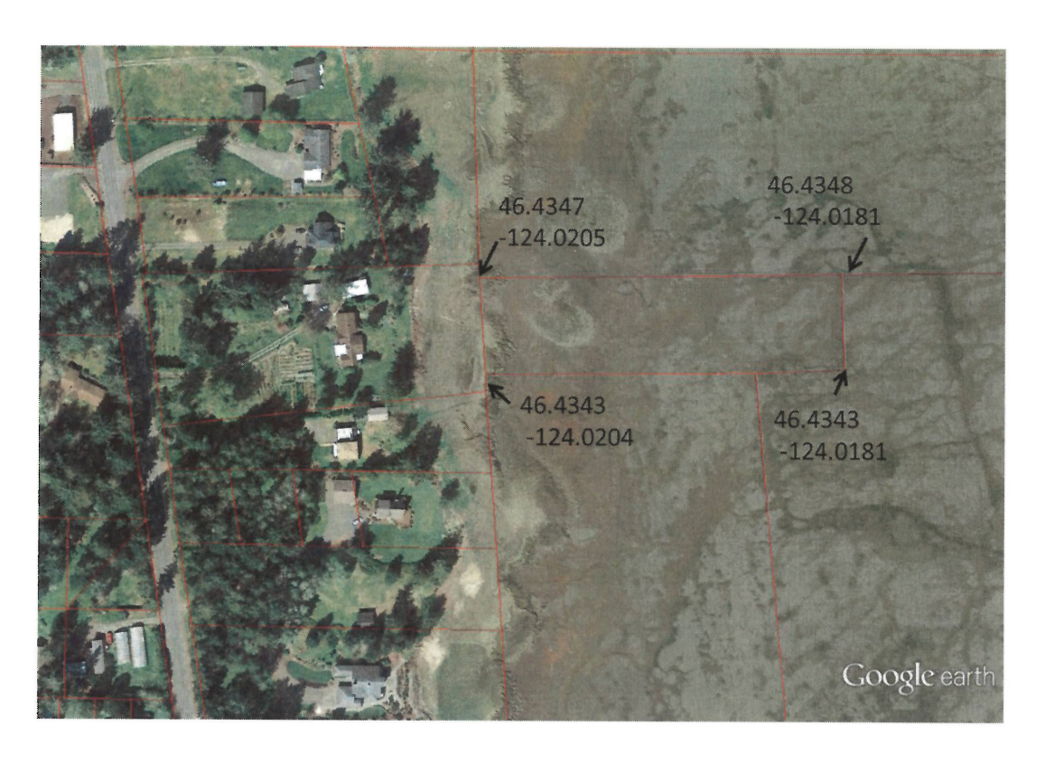
46.4347, -124.0187 S22 T11N R11W

1 acre project area, cultivating 0.58 acres Ground culture Manila clams Hand harvest