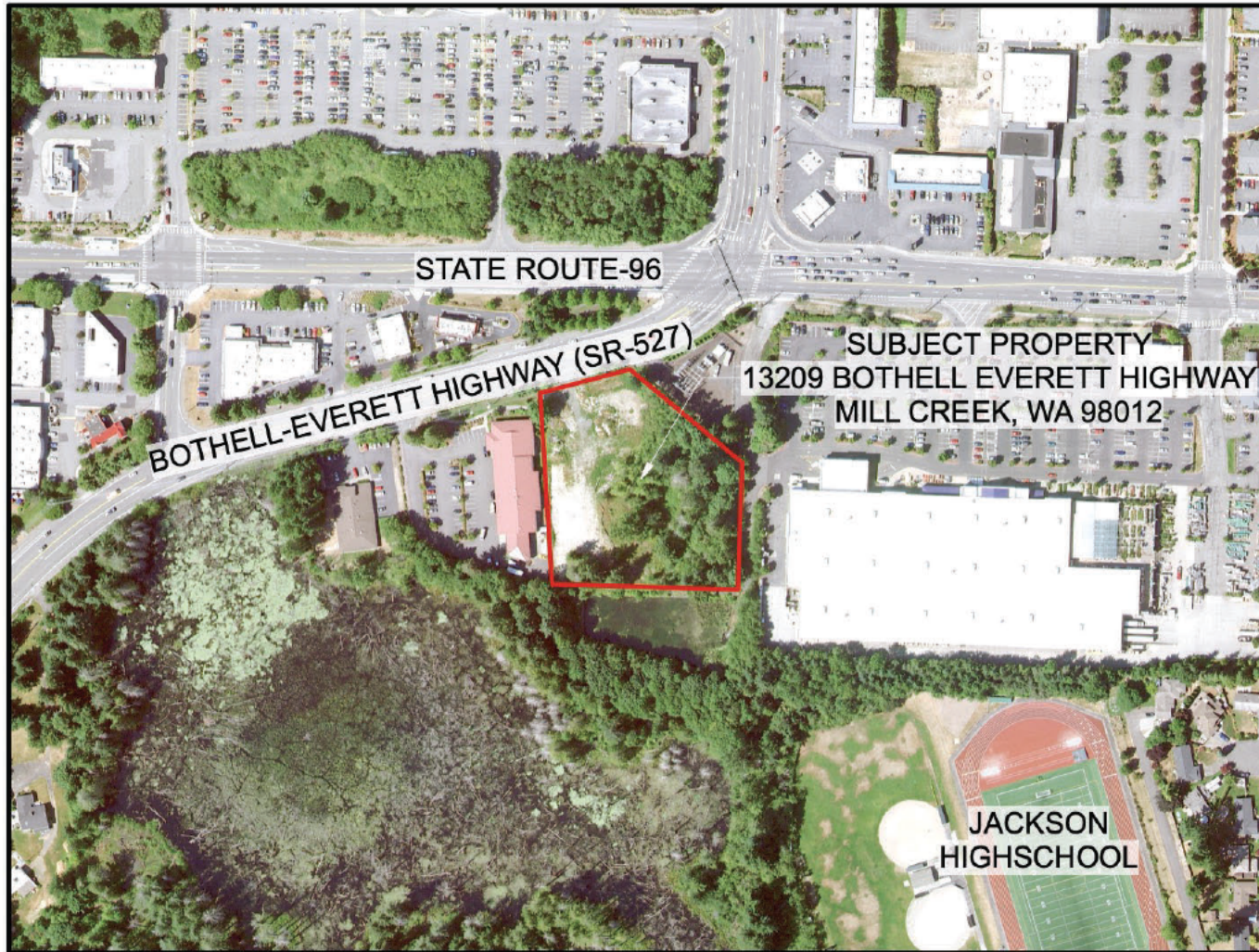
FIGURE 2: LOCAL VICINITY MAP 13209 BOTHELL EVERETT HIGHWAY PORTION OF SECTION 31, TOWNSHIP 28N, RANGE 05E, W.M.