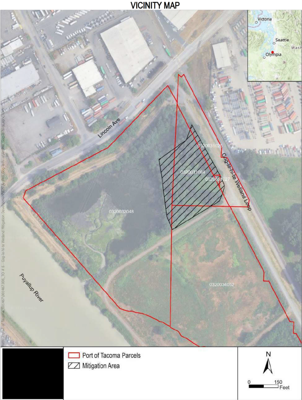
Figure 1. Mitigation area